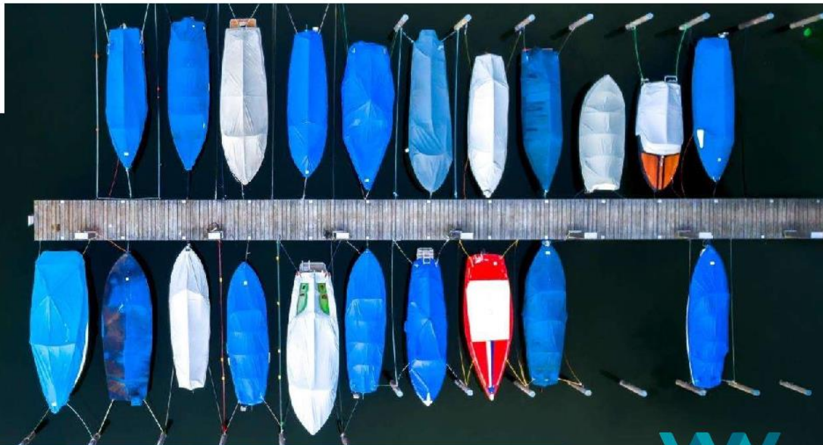
Image: photograph of an overpass of a port where several boats covered with blue tarps are (hidden text) on a lake of waters with a dark green color.

Clicksign 30cc2e51-9d3c-42c0-b586-dba95895f37d