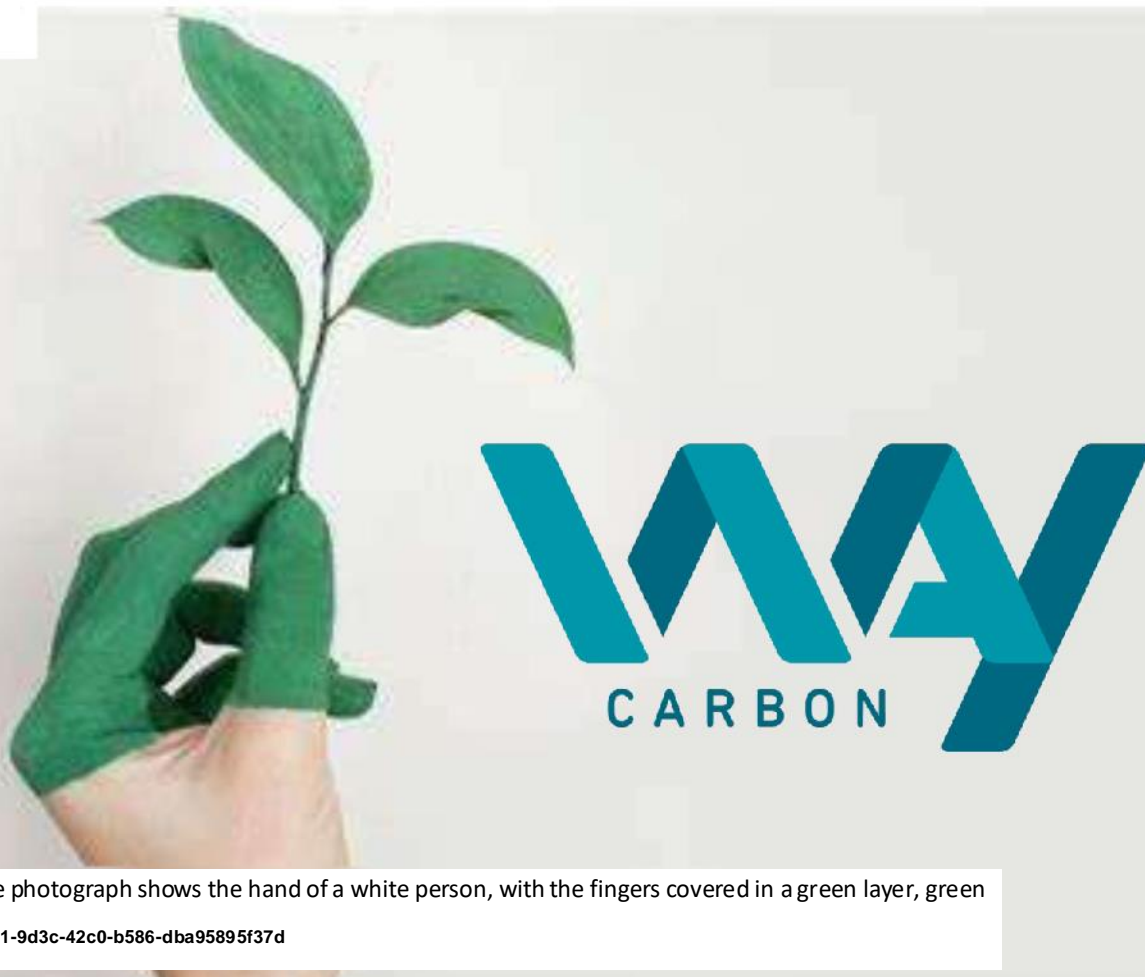
Image: The photograph shows the hand of a white person, with the fingers covered in a green layer, green

Therefore, our brand and reputation are highly valued and preserved by us, as they represent the performance of WayCarbon professionals who are proud of their trajectory and the results achieved so far.