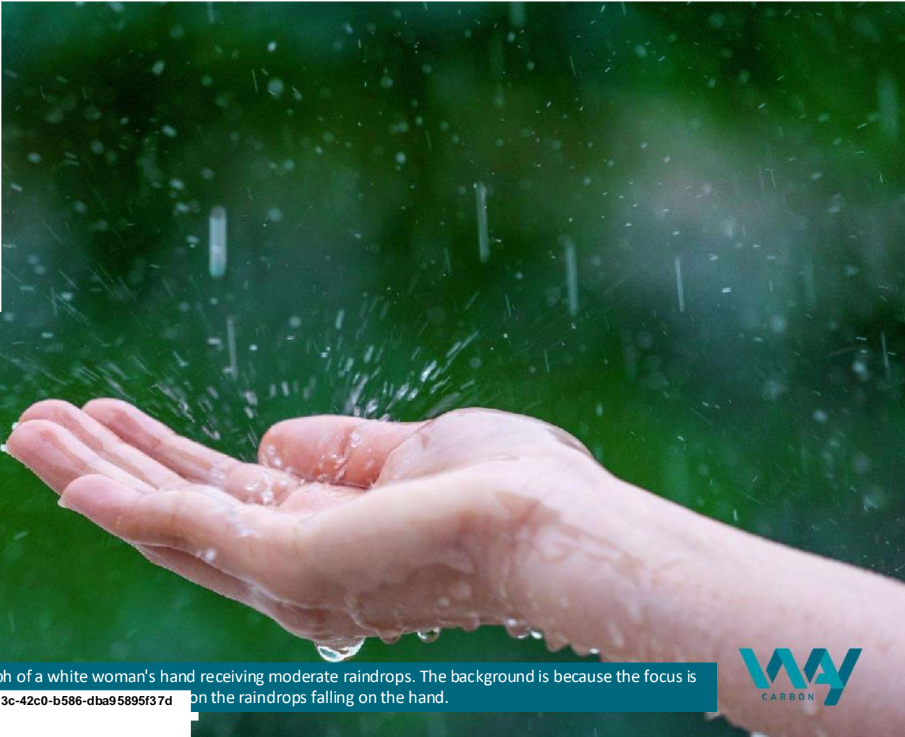
Image: Photograph of a white woman's hand receiving moderate raindrops. The background is because the focus is on the raindrops falling on the hand.

WayCarbon is committed to protecting individuals against possible retaliation. All reports will be duly investigated and resolved.