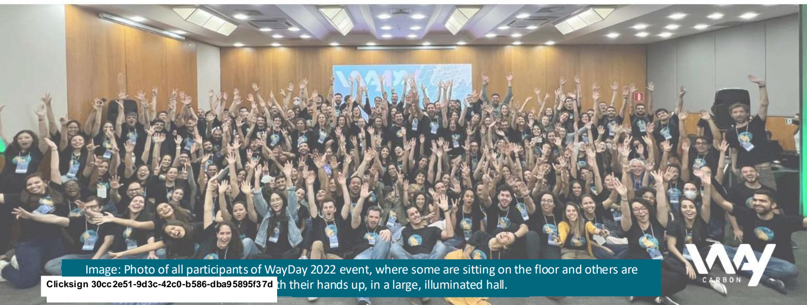
Image: Photo of all participants of WayDay 2022 event, where some are sitting on the floor and others are standing with their hands up, in a large, illuminated hall.